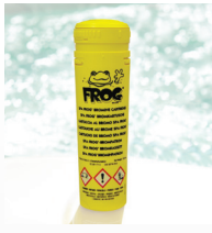
Frog® In-Line Sanitising System