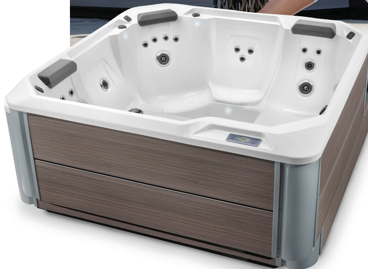
Shown with Alpine White Shell and Havana Cabinet.

People Seating Jets Voltage 5 Seats Lounge 24 Jets 240 V