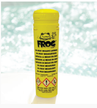
Frog® In-Line Sanitising System