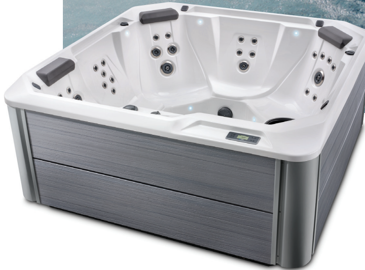
Shown with Alpine White Shell and Storm Cabinet.